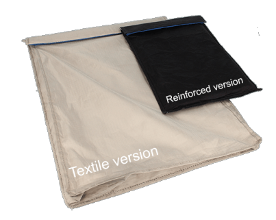
The Shielding pouch comes in two versions, a textile and a reinforced version