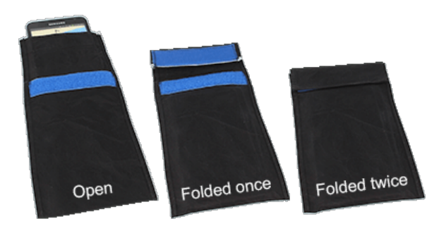
Shielding pouch fastening system