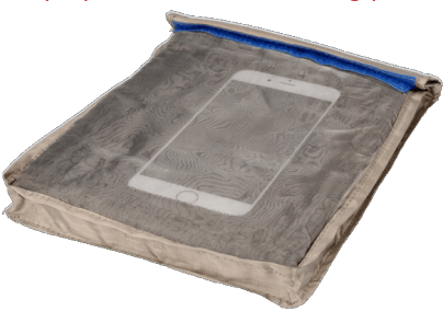
An optional RF shielding window allows access for touch screen viewing and manipulation