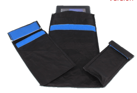
Shielding pouches block the ability of wireless portable electronic devices to access or transmit cellular signals that can potentially erase or corrupt important data