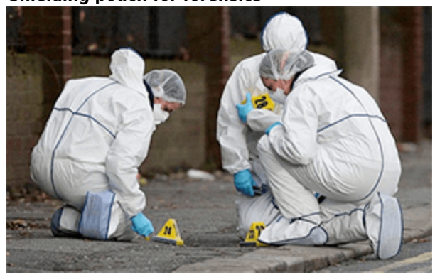
Shielding pouch for forensic research

Shielding pouches prevent cell phones, PDAs, Smartphones, Laptops and GPS units from sending signals to or receiving signals from active networks. Data on these portable devices can be secured on site using our high performance RF/EMI shielding pouches.