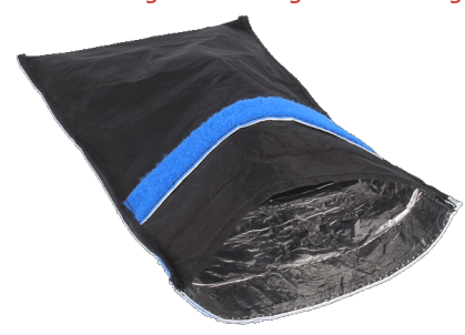
The inside is made of very strong Amucor foil which has proved itself in very heavy shielding applications, for example in defense industries