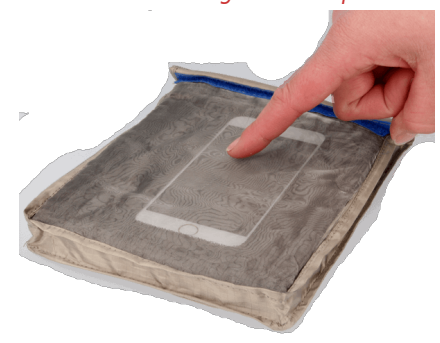
Touch screen keeps working through the mesh