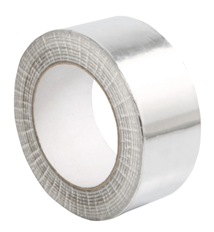
Aluminum tape for EMI/RFI shielding of aluminium housings and frames