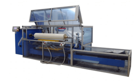
Aluminum tape can be cut in any width